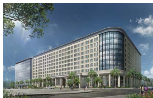
Simulation of Multi-Purpose Complex