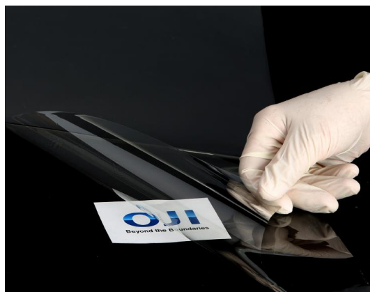
Roll sheets of CNF