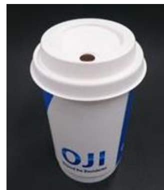
Paper Cup Traveler Lids

In addition, Oji F-TEX has begun distributing usable samples of base paper for paper straws. This base paper is water resistant and ideal for manufacturing paper straws by spiraling.