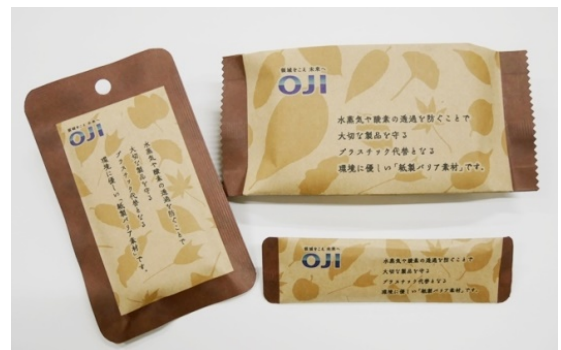
Paper Products with Added Functions

Currently, we developed recyclable packaging material to replace packaging materials with plastic barriers with paper. This paper product offers multiple barriers to protect against both water vapor and oxygen. With just paper, this product offers the same high degree of protection against water vapor as general barrier film and against oxygen as deposited film.