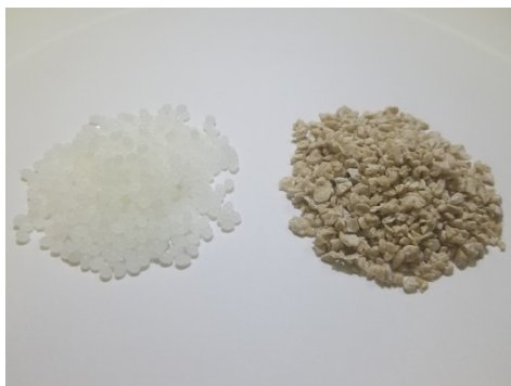
Plastic pellets (Left: Polylactic acid by itself / Right: Polylactic acid combined with pulp)

Oji F-TEX Co., Ltd. (“Oji F-TEX”) is developing plastic pellets that combine pulp with polylactic acid (*2), a biodegradable plastic. The use of pulp improves the rigidity of molded products and also improves heat resistance (temperature of thermal deformation). It is also expected to shorten the time it takes for injection molding and to expand the applications of molded products. Currently, Oji F-TEX has begun distributing samples to customers.