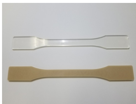
Examples of molded products (Top: Polylactic acid by itself / Bottom: Polylactic acid combined with pulp)

(*2) Polylactic acid is a synthetic resin derived from plants that can be recycled by composting.